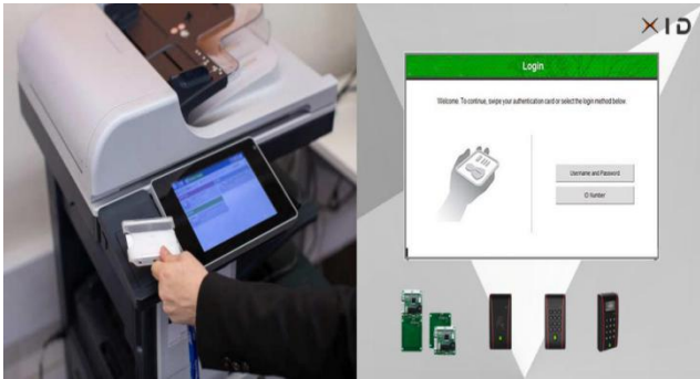
Copy and printing access control